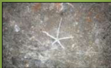
(Above) One of the many fossils in Smallin Cave

The Burlington layer of limestone contains the remains of a shallow ocean that once covered the Ozarks. Smallin Civil War Cave is encased in this layer, revealing the fossils of an ancient coral reef. Many of these fossils can be viewed from the visitor trail and in the display area of the gift shop.