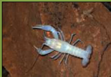
(Above) Bristly Cave Crayfish in Smallin Cave

Smallin Cave is a geological wonder teeming with life, and your visit will often include sightings of bats, salamanders, cave crickets, and rare Bristly Cave Crayfish. The white shells and sightless eyes of the crayfish are bound to make a lasting impression on your students, as well as to give a personal first-hand look into the beautiful, fragile world beneath us.